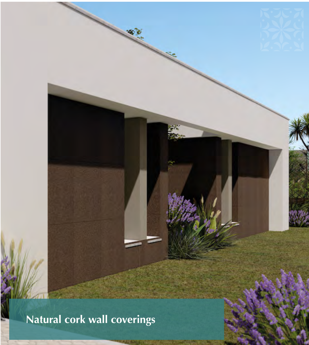
Natural cork wall coverings